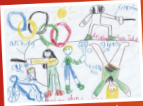
2<sup>nd</sup> place: Ellie, Kestrel