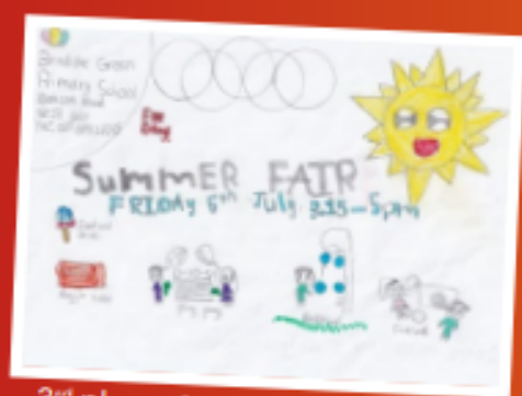
3rd place: Sompa, Woodpecker