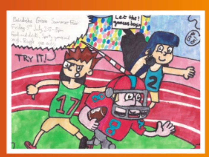
Key Stage 2 Winner Och, Macaw class